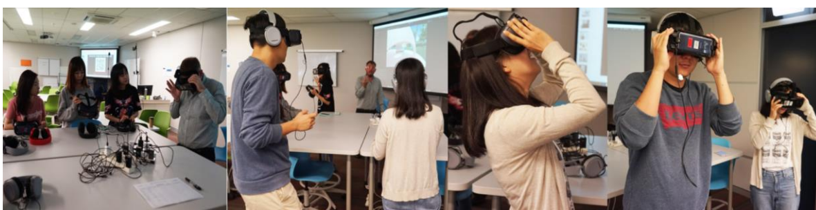
Figure 3: Communicating the virtual built environment hands-on with mobile VR technology