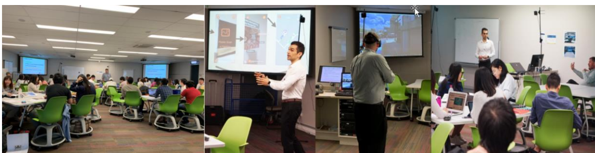
Figure 1: Future of work and impact of AI/VR/AR technology within the construction industry lecture

The specific lesson was run in the first trimester of 2019 at an Australian University and involved 45 postgraduate participants from the construction course SDCM73-100 Professional Portfolio. The subject uses situated learning and encourages students to develop their professional skills in a real-world environment by combining self-analysis and reflective learning skills with professional methodologies, to expand analytic and strategic thinking capabilities as it relates to the construction profession. The students were given a 60-minute lecture (see Figure 1) on the impact of AI, VR and AR technology within the construction industry with a demonstration of HTC VIVE and HoloLens technology as it applies to the construction industry and BIM visualisation. Students were then asked to complete two hands-on learning tasks using mobile AR (see Figure 2) and mobile VR (see Figure 3) by exploring BIM models and real-world locations enhanced with the technology.