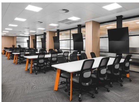
Figure 1: Medical School e-learning suite

Additionally, the format of delivering CBL content in a TBL format was facilitated by the institution's recent acquisition of key physical and technological resources. At about the time when the new TBL format was introduced in the Medical School, UWA was promoting a new Echo360 active learning platform (ALP), designed to go beyond passive lecture captures and encourage active engagement of students. The Medical School has also recently invested in building several e-learning suites with each suite accommodating 15 tables and two large 40-inch LED screens at each table (Figure 1). 8 students could be assigned to each table as their BYOD could be connected wirelessly to the LED TV screens. The design of the e-learning suite encourages collaborative study, enabling students to 'huddle together' in groups whilst discussing the cases presented, as well as engaging with activities in the ALP shown on the LED screens. The ALP employs a number of active learning tools, including real-time polling in which results are shown immediately to stimulate further discussion, 'live' Q&A to further facilitate inter-group discussions, and other functionality that promote formative and summative assessment. Two repeated TBL classes were scheduled back-to-back in a 2-hour 120-students class, optimising the use of teaching staff time.