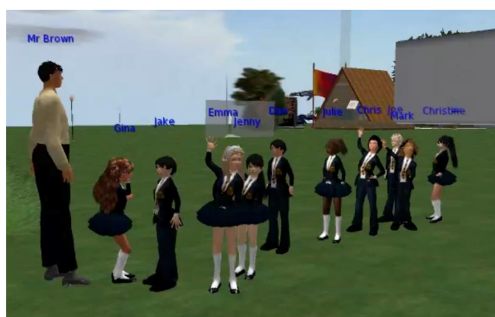
Figure 2: Demonstration of a virtual class being undertaken with teacher/student avatars

Finally, one student summed up their experience with the following: “Thanks so much for setting this up - it was hilarious and a lot of fun, as well as being educational. Really appreciate this opportunity”. Many learners throughout Australia and New Zealand have been provided with similar opportunities over the past 10+ years and each respondent would have very similar stories to share.